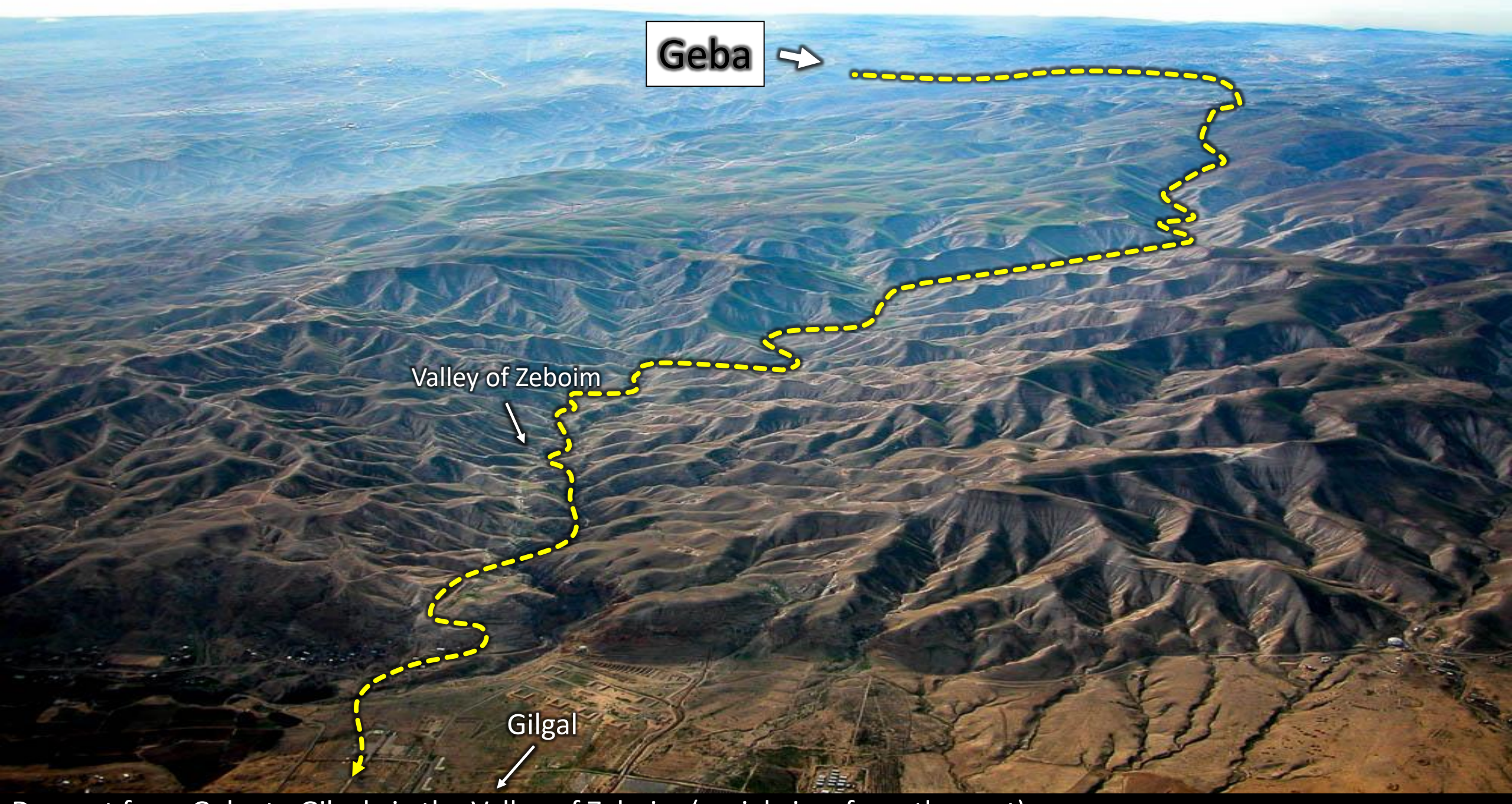
Descent from Geba to Gilgal via the Valley of Zeboim (aerial view from the east)